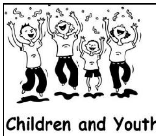
Children and Youth

Contact Janice Coen for cost information and to reserve your seat on the bus - 995-0038.