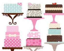
Apple Cake Contest