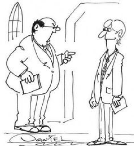
NEXT TIME WHEN I PREACH ON TITHING, DON'T SING 'JESUS PAID IT ALL' AS OUR INVITATIONAL HYMN